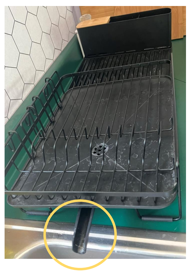
Figure 1 Make sure the drain is attached to the bottom of the drying rack.